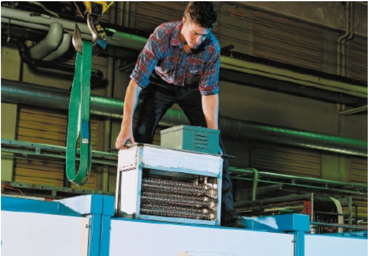
Just plug in, connect and switch on the furnace.

A change of cassette can in most cases be done from outside without cooling down the furnace and charge. If a unit should fail or if the rating is to be changed, the individual elements are very easy to replace. Existing furnaces can easily be converted to Kanthal® heating cassette units without major modifications.