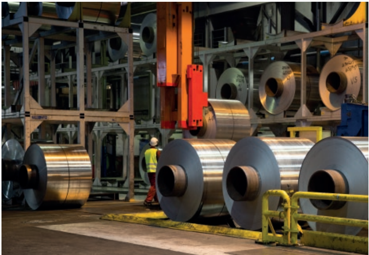
The pusher furnace at Hydro Aluminium Holmestrand, Norway. The 7-ton slabs are heated to 600°C (1110°F) before rolling by eight Kanthal® heating cassettes, four on each sidewall.